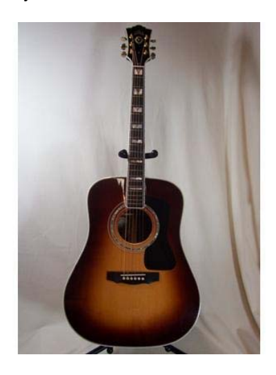
God's Word says make a joyful noise unto the Lord.

It seems that we each have some form of melody in our heart. The melody of our heart is often an accompaniment of the melody around us.