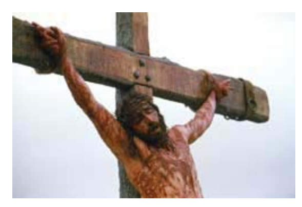
Who do you Serve and Belong to?

The Bible says "You were bought with a price" and that price was Jesus dying on a cross and rising from the dead.