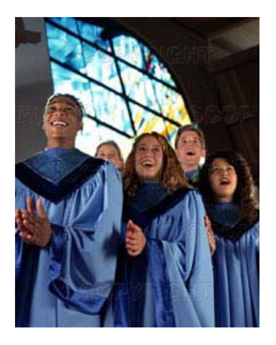
Revelation 15:3 And they sing the song of Moses the servant of God, and the song of the Lamb, saying, Great and marvelous [are] thy works, Lord God Almighty; just and true [are] thy ways, thou King of saints.

Is the command to Make a joyful noise and sing unto the Lord something of past? No, it is still a method of praise to the Lord. Even in Revelation, the last book of the Bible, it is said that they sing the song of Moses.